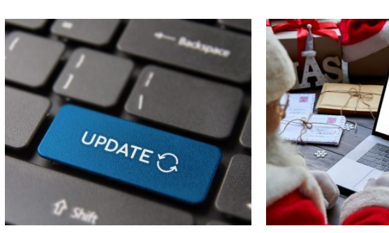
CapitalRise nears £100m milestone after record demand in 2020